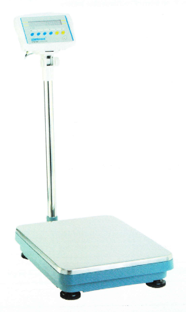
"The Affordable Choice"